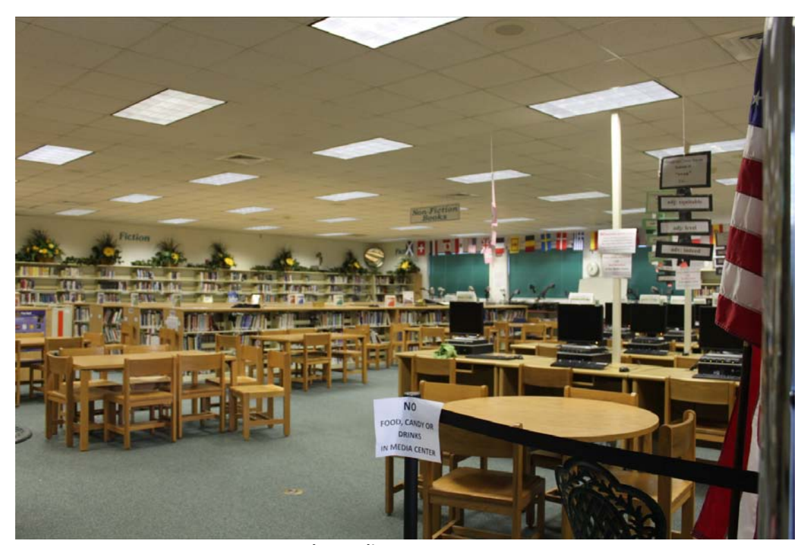
The Media Center at Evans

As for places that help children succeed, parents reported that the media center was open until 5:00 pm and offered tutoring in all subjects, research assistance, and computers with internet access. Other resources that contribute to student success included the Orange County library at Hiawassee and Ocoee streets and the local Boys & Girls Club of Central Florida on Pine Hills (operated by the Walt Disney World Corporation). All of these resources were readily accessible to students and considered by the parents as important resources in the community. The image below shows the media center at Evans.